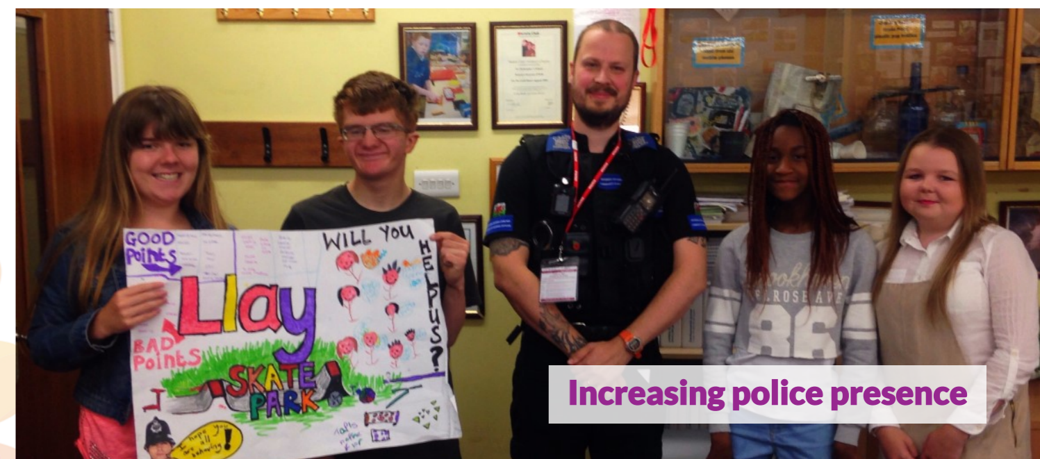
Increasing police presence

As part of this commitment, we ran 'Communicating Effectively for Change' training, in partnership with HOPE not hate. This covered the facts and figures on refugees, and techniques for having conversations confidently and effectively on challenging issues such as immigration and race.