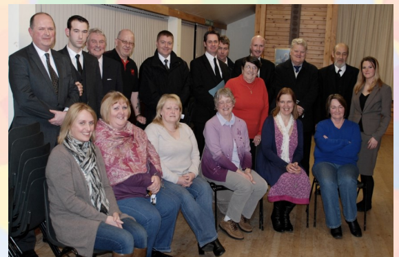
TCC members meeting with funeral directors in Wrexham

For more information or support, please contact TCC.